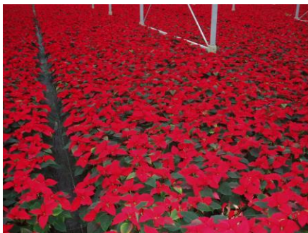
Potted well: Optimum conditions, trouble-free cultivation.

A simple measurement is all it takes for you to know exactly how firmly you do pot. You can compare your measurements with the RHP Potting Reference. The potting reference is the standard density based on measurements from professional companies. Your own measurements, compared to the potting reference, form the basis for any adjustments to be made to your potting soil (stability, water and air amounts, nutrients).