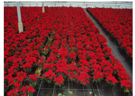
Potted too firmly: dying roots, more susceptibility to disease, harder to control.