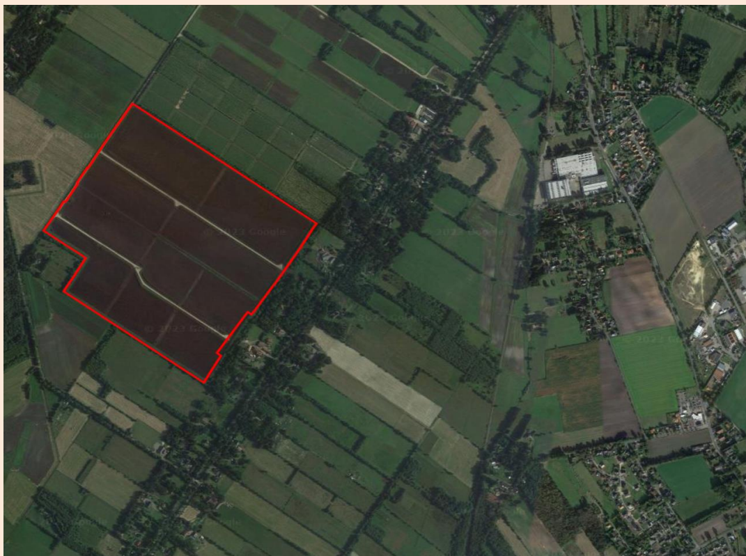
Figure 1: Aerial view of the extraction site

See images below for license boundaries and nearest protected areas