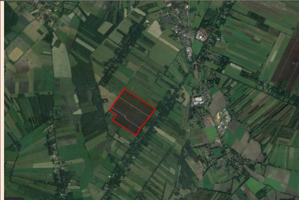
Figure 2: Areal view of environment