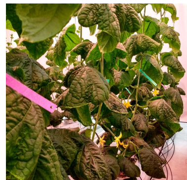
Figure 3. Cucumber plants of cv. 'Proloog' grown under narrow-band red/white LED two weeks after transplanting.