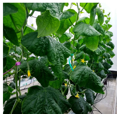
Figure 2. Cucumber plants of cv. 'Proloog' grown under broadband white LED two weeks after transplanting.